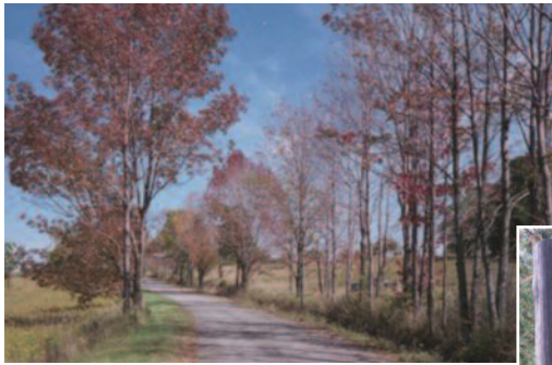
Irish Hill Road leading to Greensprings Cemetery.