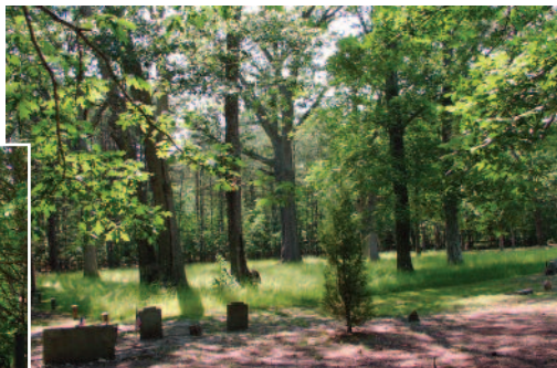
Steelmantown Cemetery is set in the quiet tranquility of the Pine Barrens.

Native trees or shrubs mark gravesites and help restore the land to its natural state along with providing shelter and food for wildlife. Both Greensprings and Steelmantown Cemeteries offer a quiet, peaceful setting to experience the natural beauty of woods and fields . . . a legacy of enduring stewardship.